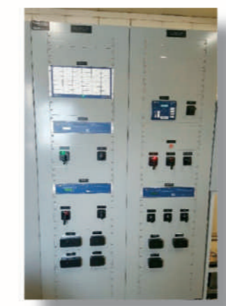
Lantana Substation Controls After