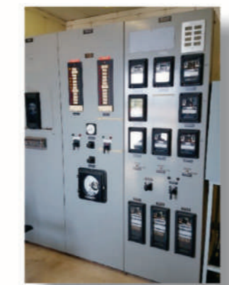
Lantana Substation Controls Before