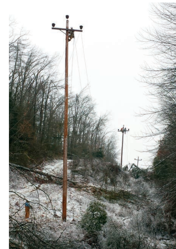
Climbing high to restore power