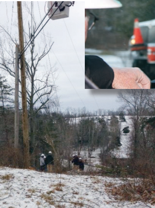
Cold, hard work in Fentress County