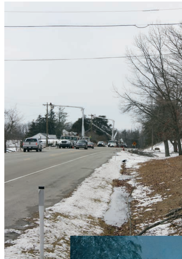
Line crews tackle difficult repairs