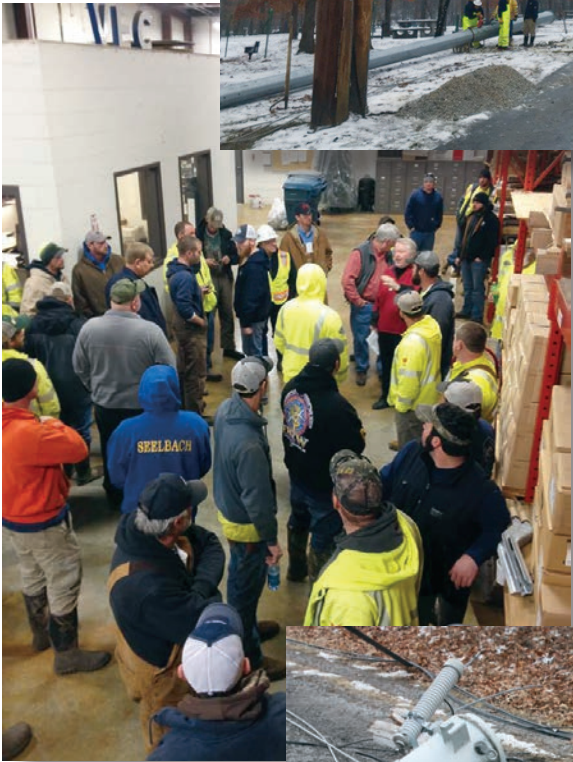
Workers receive instructions as they prepare to begin restoration