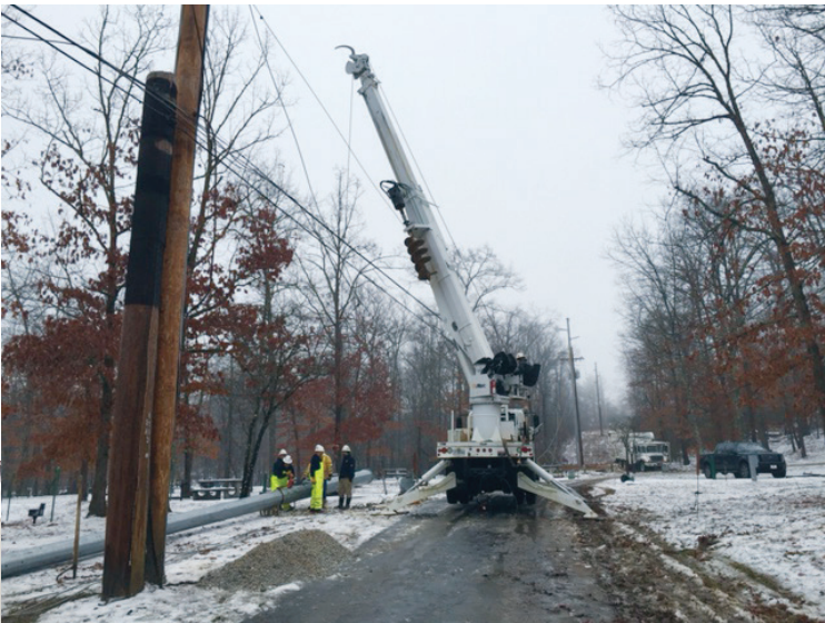
Transmission line repair