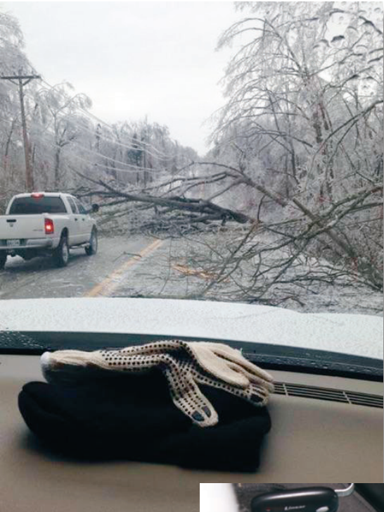
Impassable roads in Putnam County

Editor's note: This issue of Powerlines includes photos of the storm damage and outage restoration on the VEC system in February.