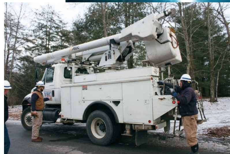
VEC crew prepares to work on the Cumberland Plateau