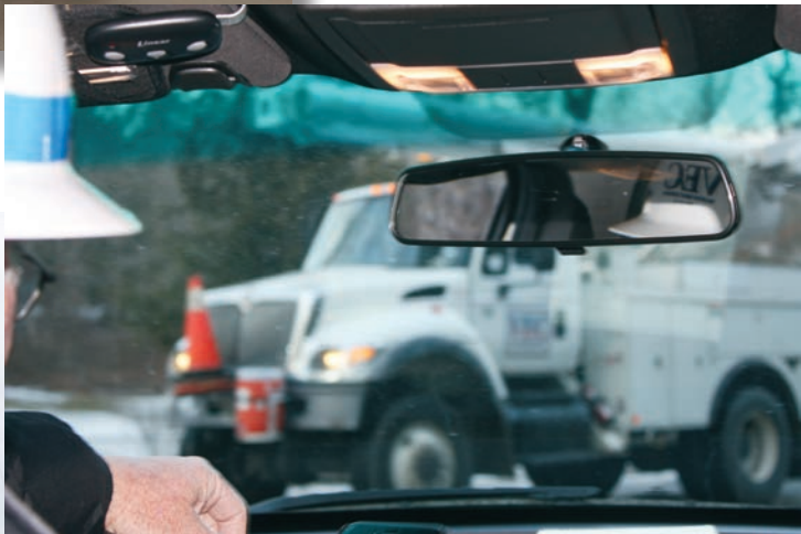
Power restoration includes lots of "windshield time"