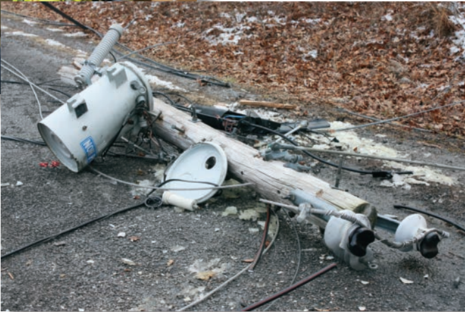
Electric equipment such as this transformer suffered major damage when poles broke and lines came down

Residential & Outdoor Lighting Fuel Cost Adjustment Effective March 1, 2015