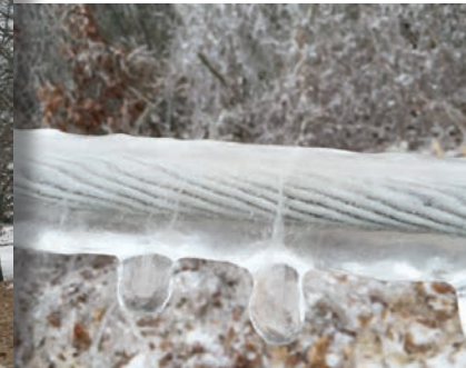
Lines throughout the VEC service area were covered in ice