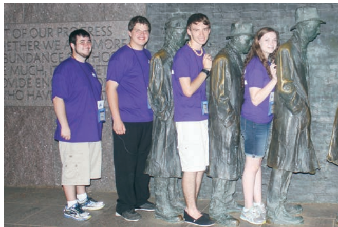
VEC Youth Tour participants pose at the Franklin Roosevelt Memorial.

Youth Tour. This year's trip marked the 50th anniversary of Tennessee's participation in the enriching, inspiring program for the young leaders from co-ops service areas.