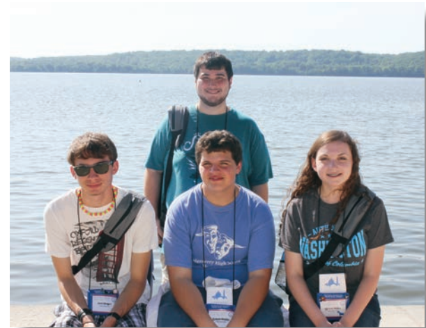
VEC's WYT group visited Mount Vernon on the Potomac River as part of the trip.