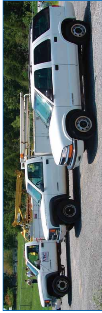
Volunteer Energy Cooperative will be offering surplus vehicles like the ones pictured for absolute auction. Following is a partial list of vehicles to be auctioned*:

The sale is slated to begin at 10 a.m. (ET). Vehicles for sale will be available for inspection from 1 p.m. to 6 p.m. (ET) on Friday, October 8 at the same location. All vehicles purchased must be paid for on the day of the sale by cash or check.