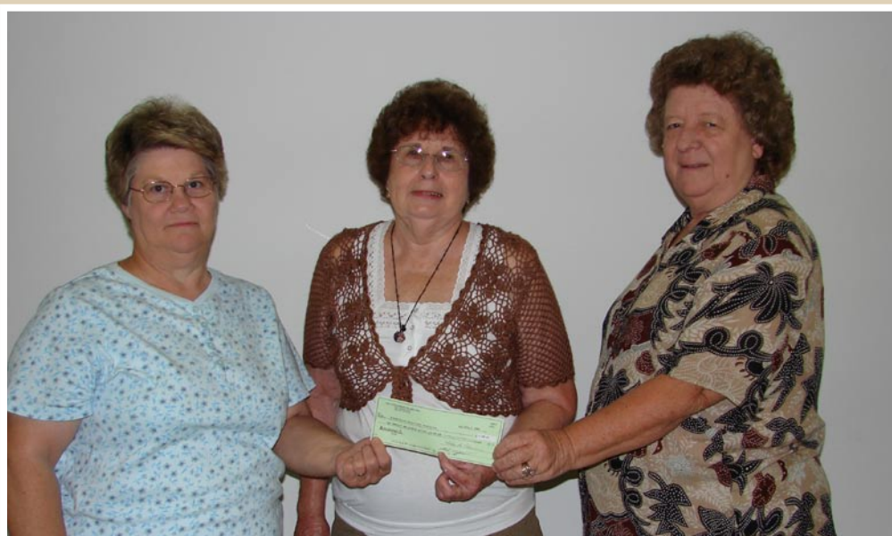
McMinn County Foster Care Association