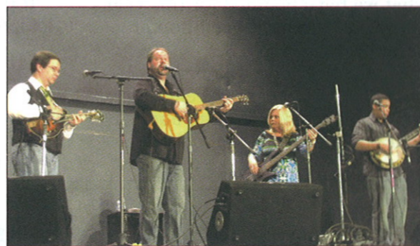
Just Us Bluegrass Band will open up the entertainment portion of Volunteer Energy Cooperative's 2010 Annual Meeting.