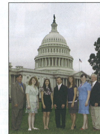
A VIP tour of the U.S. Capitol Building and meeting U.S. Senators and U.S. Representatives were highlights on the 2010 Washington Youth Tour.

On the tour, students saw famous sites they have learned about in school, including the White House