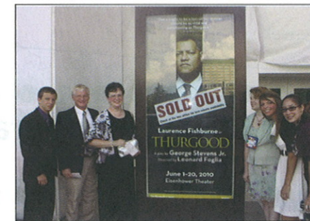
Youth Tour participants enjoyed a night out on the town featuring a performance of "Thurgood" starring Laurence Fishburne at the Kennedy Center for the Performing Arts.