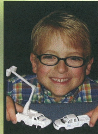
Toy Bucket Trucks & Pick-up Trucks $5.00 plus tax