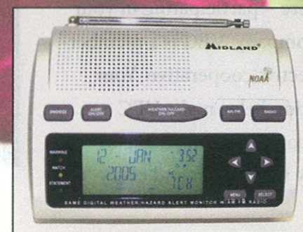
Midland WR-300 Weather Radio $59.95 plus tax

Stop by your local Volunteer Energy Cooperative Customer Service Center to pick up these great holiday gifts.