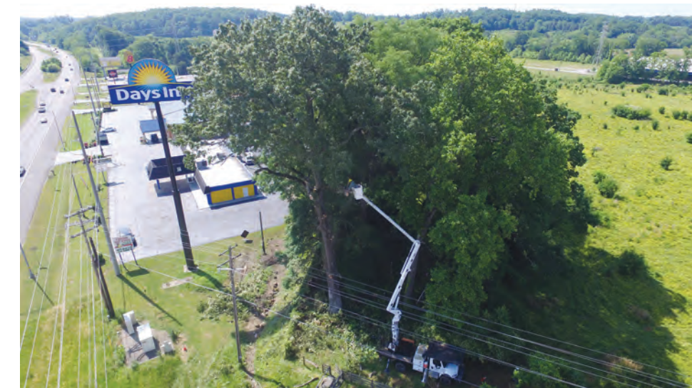
A drone image of the tree and the 100 ft. bucket truck.